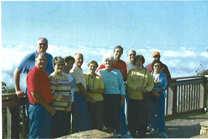
We have a great time!

Fall is here and we can see God's handiwork before our eyes!